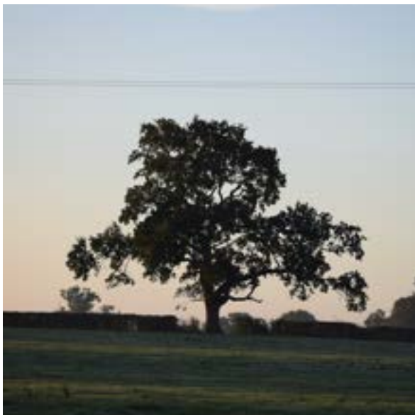
Chloe in Y11 is a keen photographer. Here are a couple of her most recent local shots.