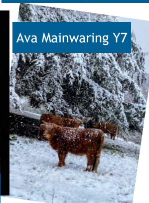
Ava Mainwaring Y7