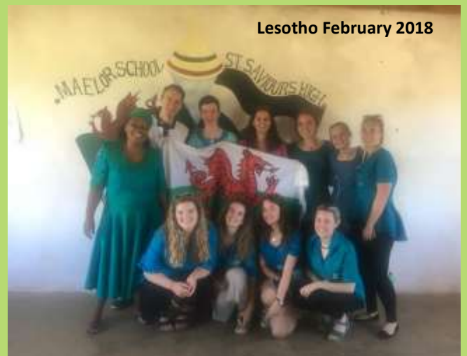
Lesotho February 2018

Kea leboha/Diolch/Thanks to everyone involved with the link from the first pioneers over a decade ago, to anyone who has thrown 20p in a collection bucket. From personal experience I can honestly say that every penny makes an incredible difference to the lives of so many people.