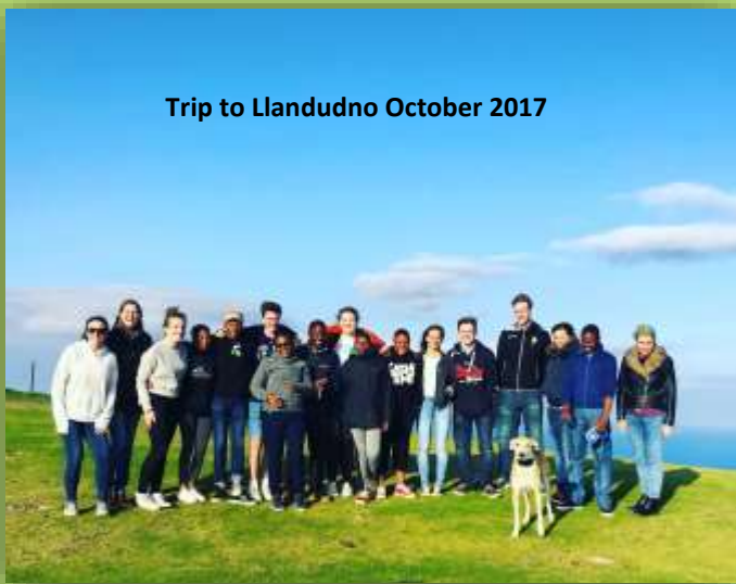
Trip to Llandudno October 2017

I am confident I speak for all who went this February when I say that our incredibly humbling trip to Hloste (Hl is pronounced as LL in Welsh) has taught us so much..... Not least that appreciating and doing the little things in life can be extremely self-fulfilling.